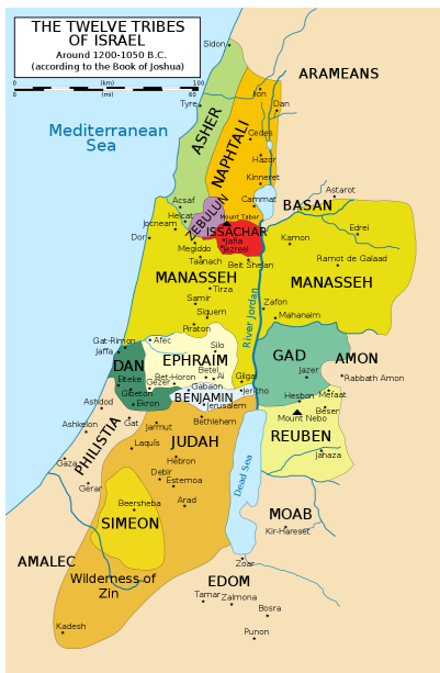
See Gilgal just north of Jericho & East of Ephraim